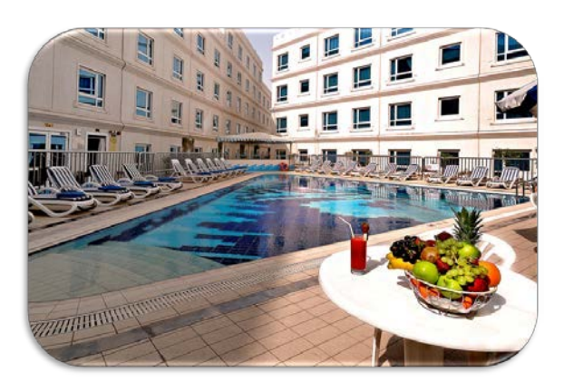
Accessible Swimming Pool